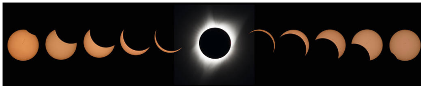
A time-lapse photograph of the solar eclipse that occurred on August 21, 2017.

Why don't we see lunar and solar eclipses more often?