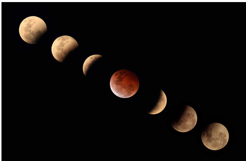
A time-lapse photograph of the lunar eclipse that occurred on April 14, 2015.