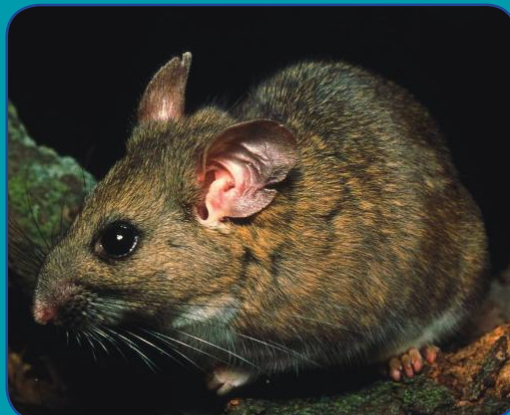
PETERSON B. MOOSE/USFWS